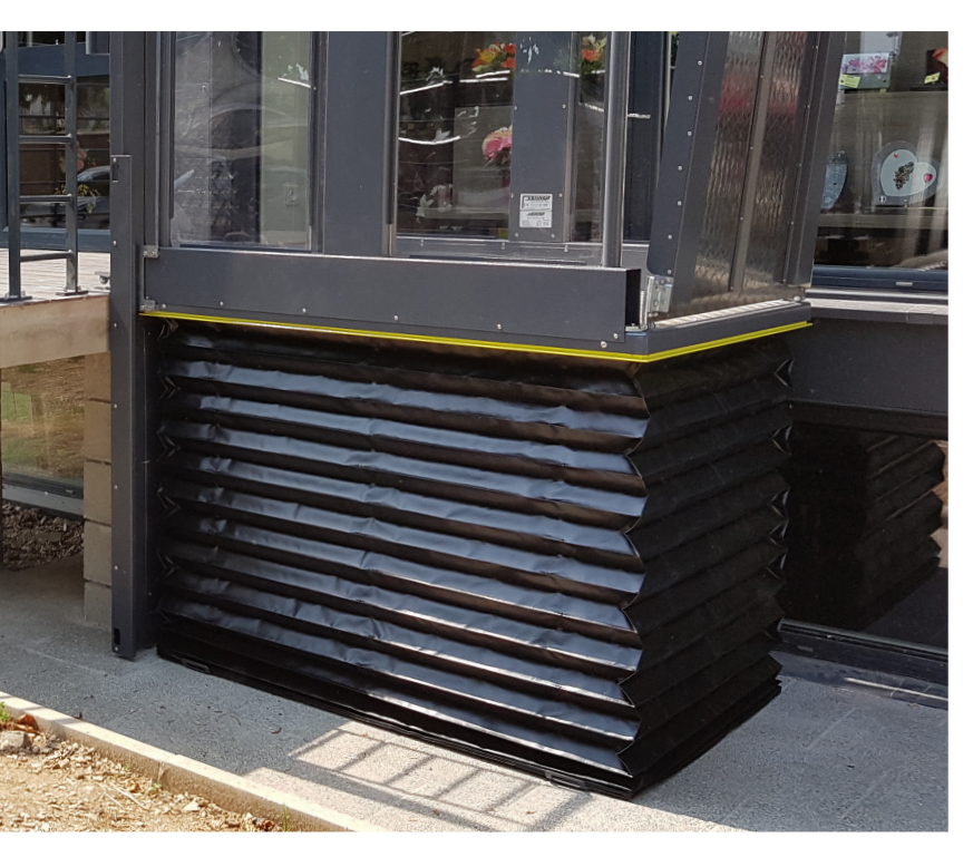
Protection covers and protection bars on all 4 sides provide for highest safety

Simple access guaranteed by a long access ramp and a minimal platform height when folded